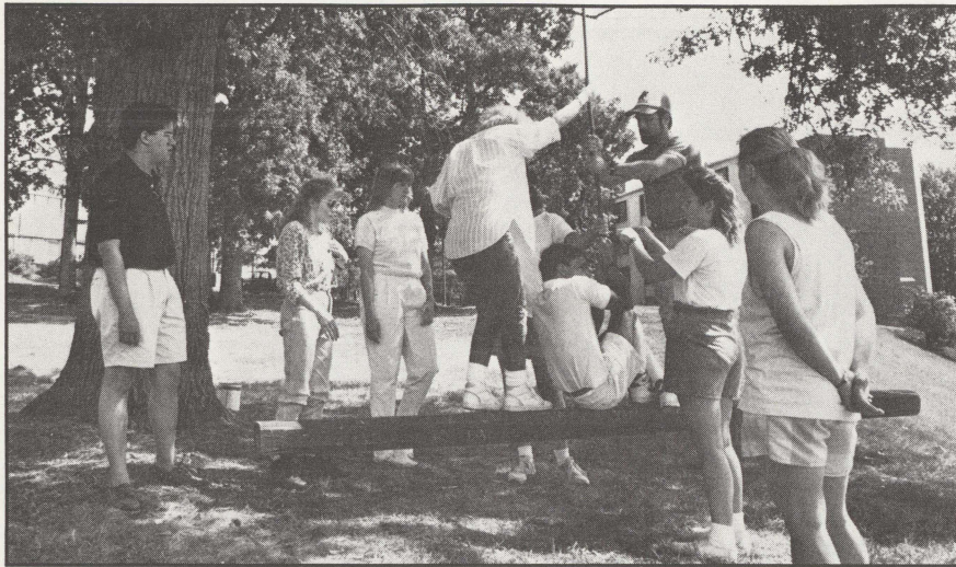
Students in the New Signers Program, an annual program that acclimates new students to the Gallaudet Community, work on building teamwork skills in a Discovery exercise.