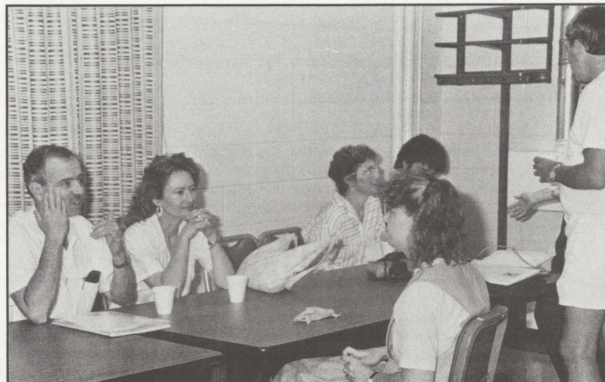
Parents of freshman and transfer students share concerns over coffee at Student Affairs' Parent Orientation, which was extended to a full day this year.