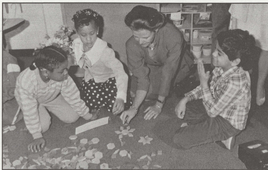
Queen Silvia of Sweden plays with children in a Kendall classroom during her April 11 visit to Gallaudet. The Queen and a Swedish delegation interested in disability issues also visited House One, Gallaudet Television, and the Archives.