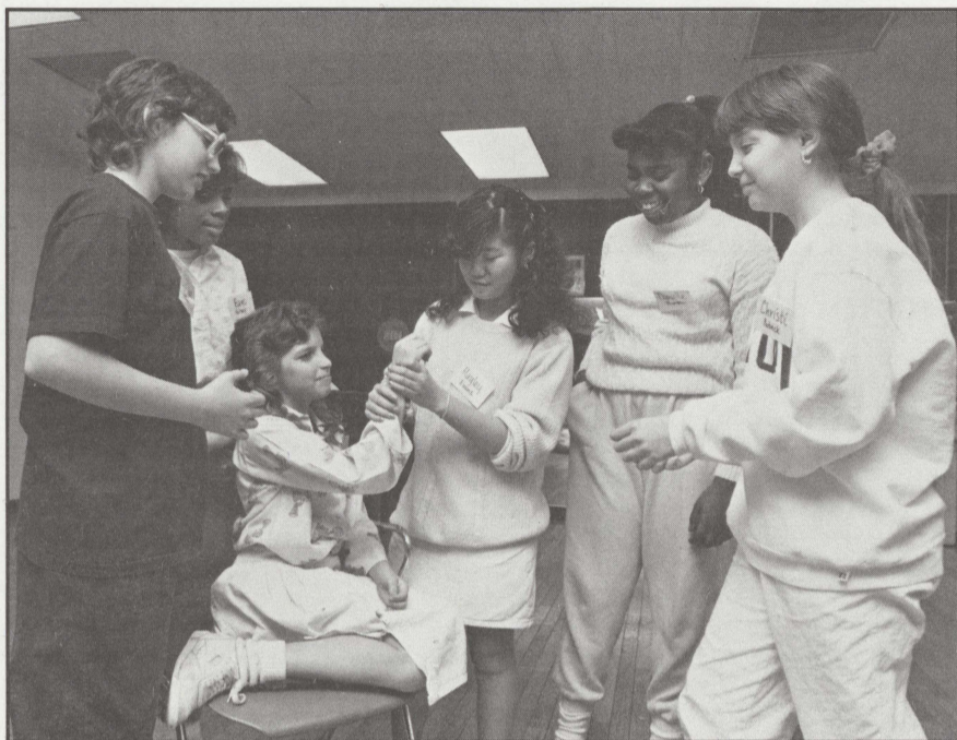
Students from KDES and Sidwell Friends School share a moment of communication. Ten Sidwell students spent four days at Kendall to get acquainted and participate in theater games.