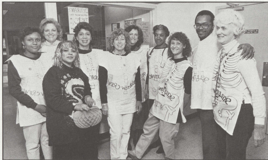
Health Services staff get in the Halloween spirit by donning skeleton smocks for the day. They dubbed themselves the "skeleton crew" because their department is understaffed.

INSTRUCTOR: KDES PRODUCTION EDITOR: Gallaudet University Press TEACHERS' AIDE: KDES DIRECTOR OF ADMISSIONS: Admissions Office OFFICE SERVICES SUPERVISOR: Office of the Dean, KDES