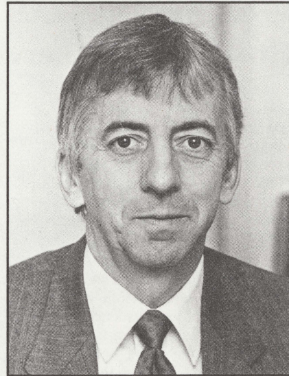
Dr. I. King Jordan