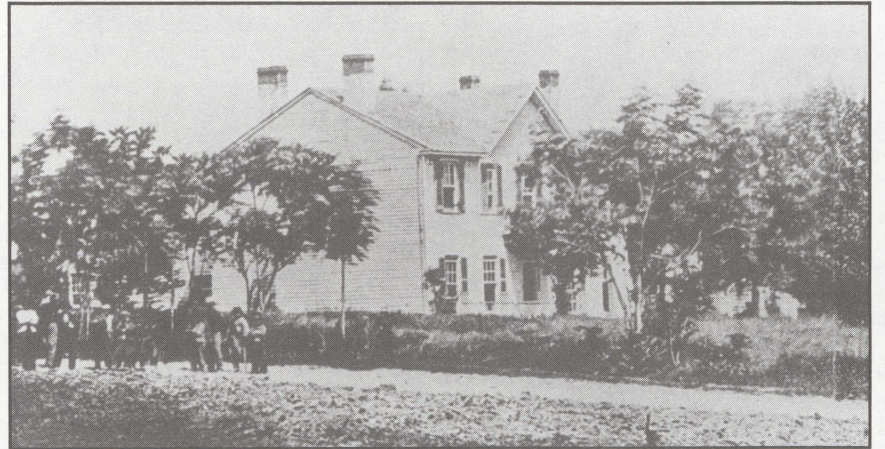
Rose Cottage, the "Cradle of Gallaudet," is shown in a Gallaudet Archives photo circa 1866