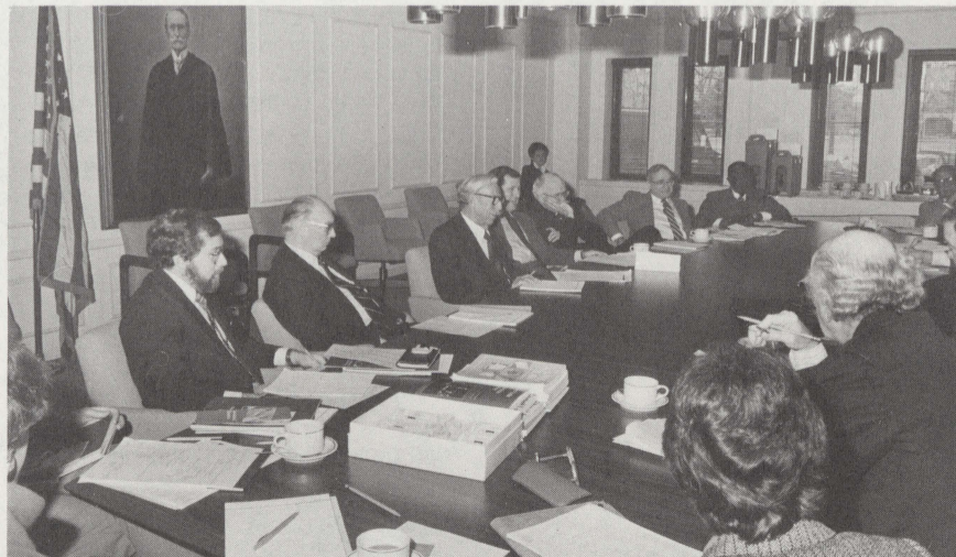
The semi-annual board meeting of the Metropolitan Washington Consortium of Universities and Colleges was held on campus Feb. 5. The presidents of the member institutions serve on the board. Gallaudet is part of the Consortium.