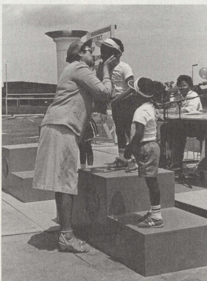
A Special Olympian is congratulated on the victory stand during the Sixteenth Annual District of Columbia Special Olympics Spring Games, held on campus June 1 and 2.

The Venture Club is an organization of young business and professional women.