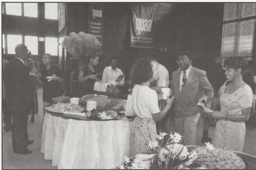
Students, staff, and faculty welcome new African-American students to Gallaudet with a reception in their honor held Sept. 14 at "Ole Jim." The event was sponsored by the Organization for Equity of African Americans and the Black Deaf Student Union.