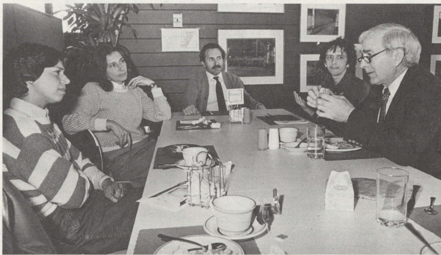
The School of Education and Human Services held a lunchtime faculty development seminar April 18 at "Ole Jim." Pictured are some of the participants.