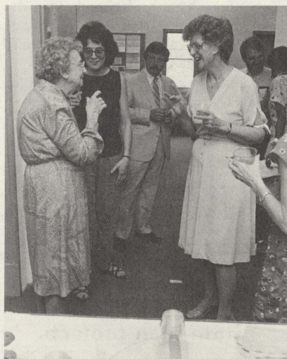
The School of Communication held an open house Friday, April 27 at its offices in the newly renovated Kendall Hall. The Department of Interpreter/Transliteratior Instruction and the Department of Sign Communication are housed there.

While lunch will discontinue on May 18, Happy Hour will continue every Thursday and Friday from 4 to 7 p.m.