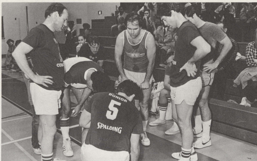
The Congressional All-Star team takes a break during the recent basketball game against students from MSSD. The students won the game by two points in overtime action.