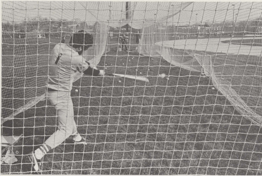
A member of the men's baseball team gets in some batting practice as the baseball season gets under way.