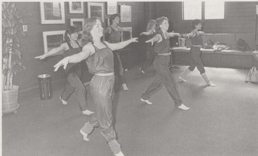
The Gallaudet Dancers performed for the lunch crowd at "Ole Jim" April 10, giving a glimpse of numbers from the upcoming spring program, April 27-29. The dancers also appeared earlier this month at the Dance Exchange in "New Uses of Language in the Arts."

If you would like to participate (it's free and interpreted, of course!), call the Alumni and Public Relations Office at x5100 (voice) and x5104 (TDD).