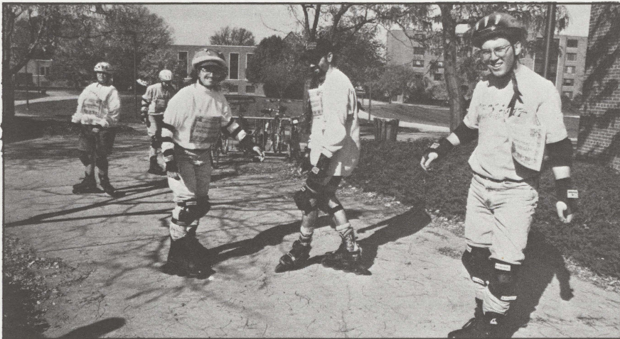
Rollerbladers experience a "natural high" at the Substance Abuse Awareness Fair Oct. 29.