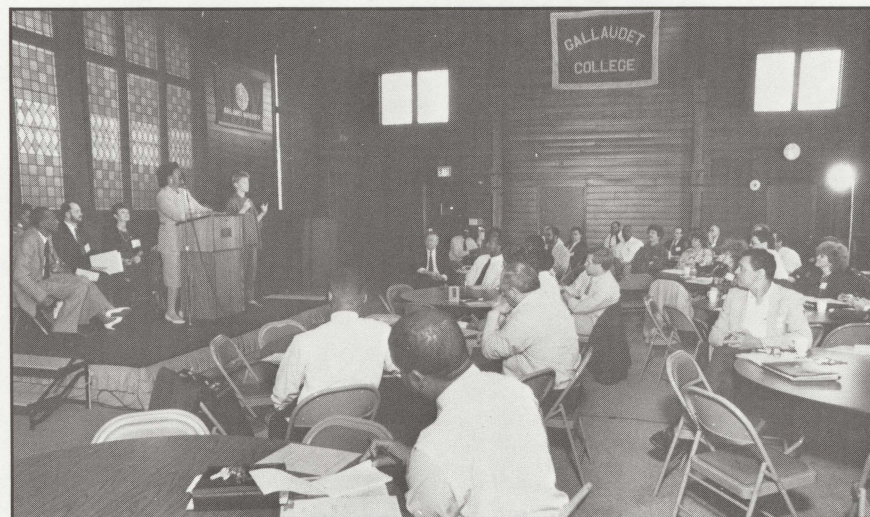
Representatives from 76 local deaf- and minority-owned businesses learned how to sell their products and services to Gallaudet at a workshop held in "Ole Jim" April 23.