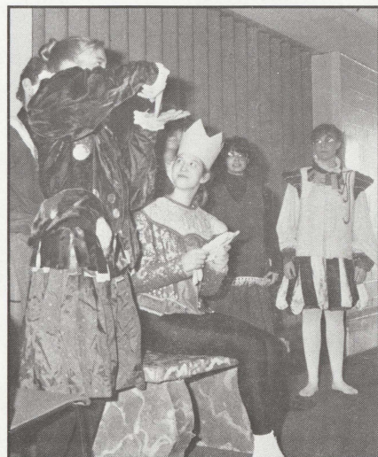
Students perform at MSSD's Shakespeare Festival, held March 30-April 8 to celebrate the contributions of the bard.

Gallaudet University is an equal opportunity employer/educational institution and does not discriminate on the basis of race, color, sex, national origin, religion, age, hearing status, disability, covered veteran status, marital status, personal appearance, sexual orientation, family responsibilities, matriculation, political affiliation, source of income, place of business or residence, pregnancy, childbirth, or any other unlawful basis.