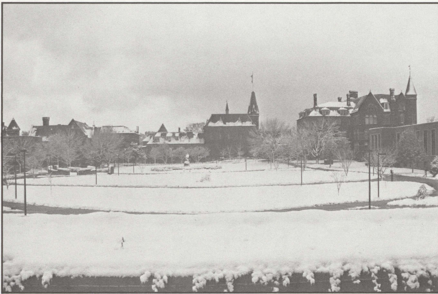
Snow has fallen on the Washington, D.C., area twice in the past three weeks, an indication that winter may be settling in with a vengeance.